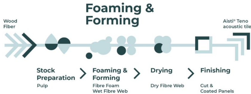
Foam forming process